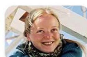
Tea Jänes Internal Communication