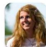
Kaia-Kaire Hunt Conferences